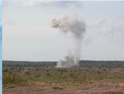
Lithuania, 7 June 2004